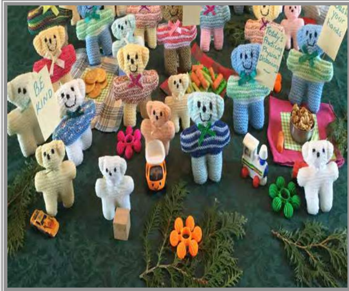
TEDDY'S FOR KIDS IN EMERGE- ST. DUNSTAN