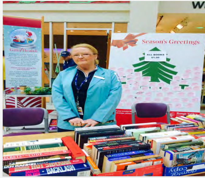
BOOK SALES - CENTENARY