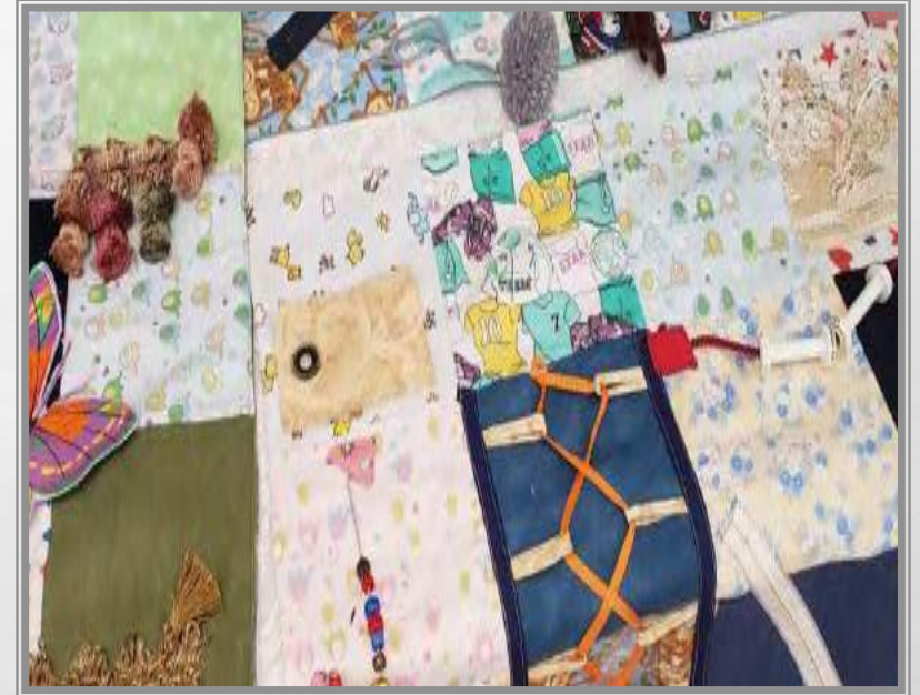
FIDDLE BLANKETS- ALC PATIENTS – ST. DUNSTAN